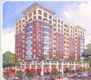
8 The West at North 170 units of residential 17,000 sq ft of retail