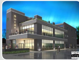
6 Solas 15,000 sq ft of entertainment retail space