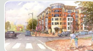
17 Blount Street Commons +/- 500 units of residential 110,000 sq ft of retail & office space