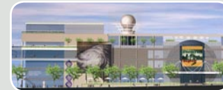
16 Green Square Expansion of NC Museum of Natural Sciences