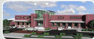
1 Seaboard Station 114,000 sq ft of retail space