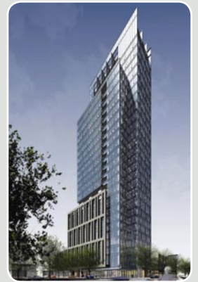
19 301 Hillsborough 50 units of residential 17,390 sq ft of retail 125 hotel rooms