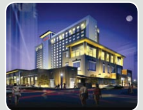
20 Marriott Hotel 400 hotel rooms Ground-floor restaurant