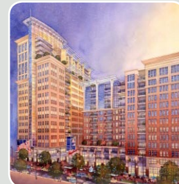
11 Site One 154 units of residential 200,000 sq ft of office space 61,000 sq ft of retail space