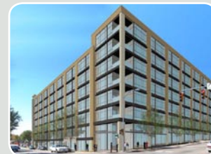
13 The L 100,000 Sq. Ft. of office space 8,000 sq ft of retail space