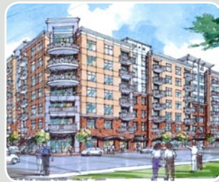
5 222 Glenwood 117 units of residential 22,000 sq ft of retail space