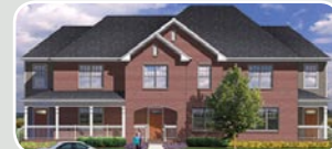
12 Chavis Heights 165 units of mixed-income residential HOPE VI redevelopment project