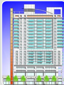
9 The Lafayette 80 units of residential 120 room boutique hotel 9,000 sq ft of retail space Rooftop bar and swimming pool