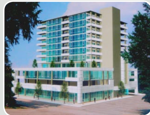
3 630 North 41 units of residential 29,000 sq ft of office space 3,400 sq ft of retail space