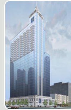
15 RBC Plaza 139 units of residential 17,000 sq ft of retail space 275,000 sq ft of office space