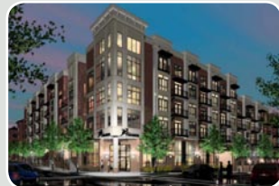
4 712 Tucker Street 179 units of rental residential