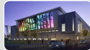
10 Convention Center 500,000 sq ft total; 150,000 sq ft exhibit hall; 32,000 sq ft ballroom