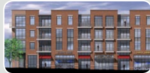
2 111 Seaboard 53 units of residential 11,000 sq ft of retail