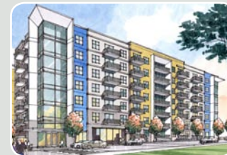
18 The Hue 207 units of residential 8,000 sq ft of retail