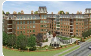
7 Bloomsbury Estates 110 units of residential