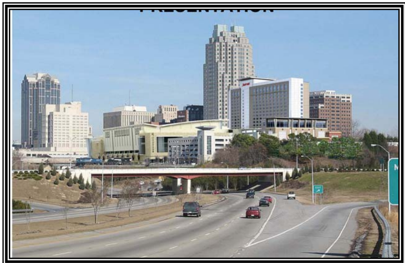
Convention Center Marriot Hotel